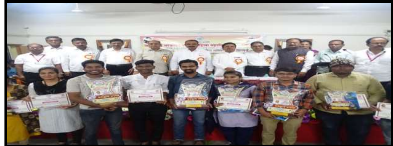
State Level Elocution Competition