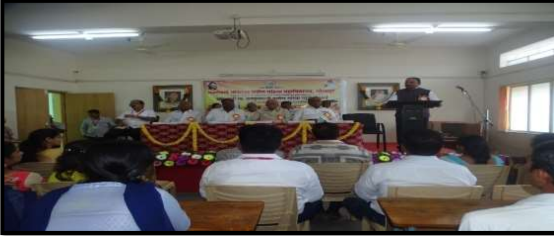
State Level Elocution Competition