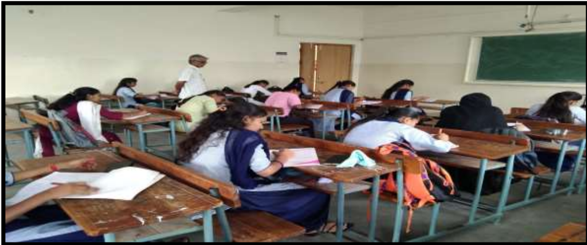
Open Book Test