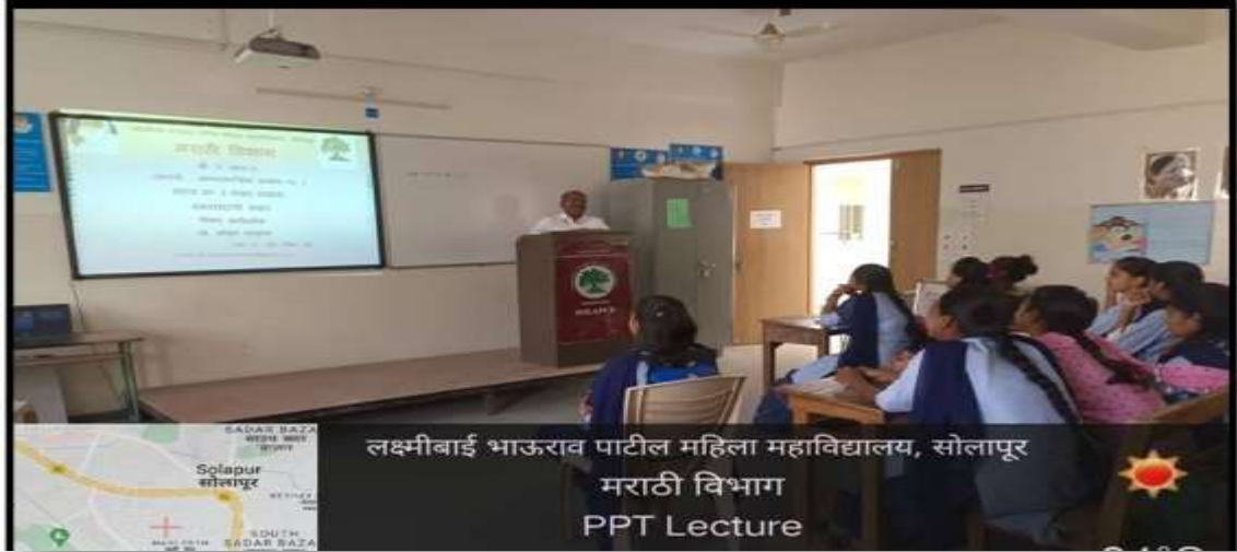
लक्ष्मीबाई भाऊराव पाटील महिला महाविद्यालय, सोलापूर मराठी विभाग PPT Lecture