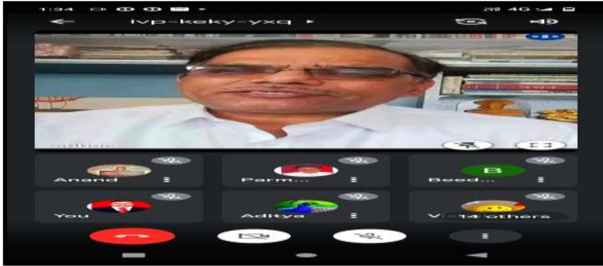
Workshop on New Syllabus