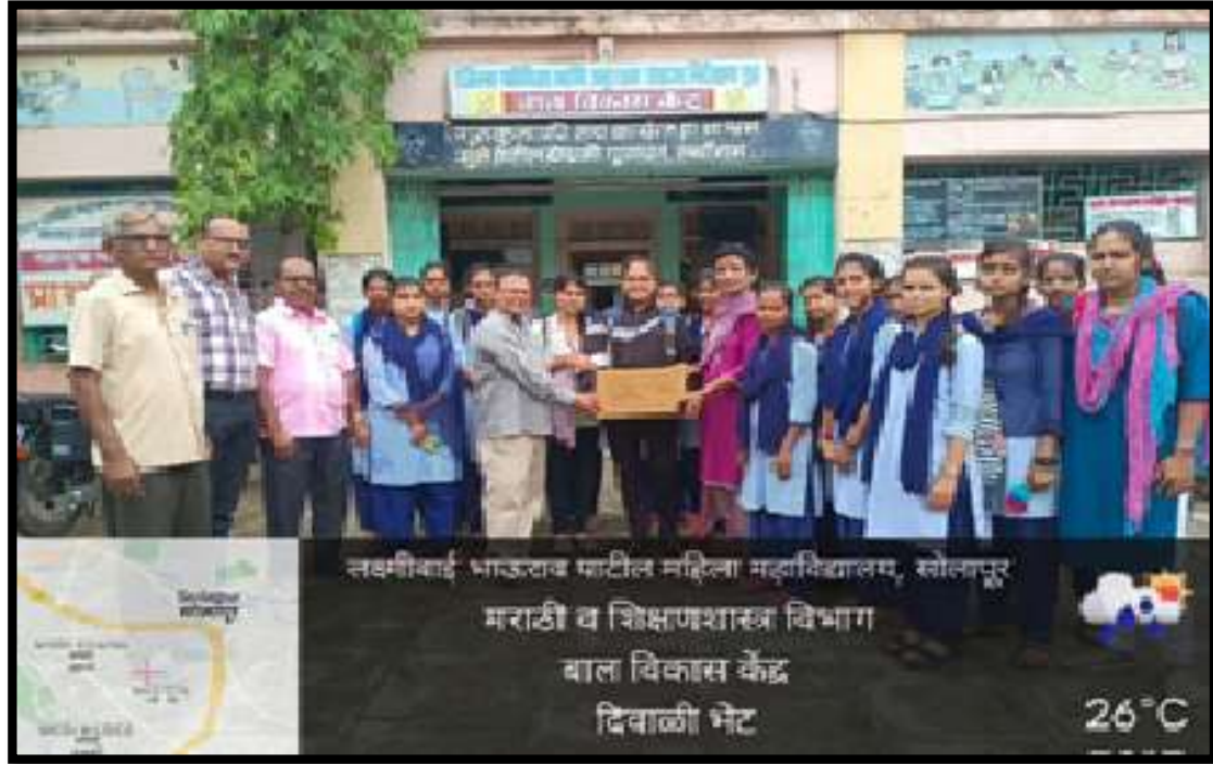
Visit to Children of Remand Home