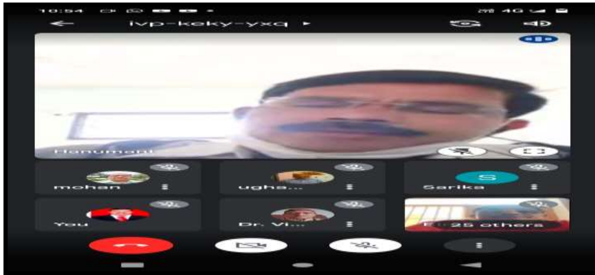
Workshop on New Syllabus