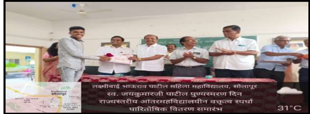
State Level Elocution Competition