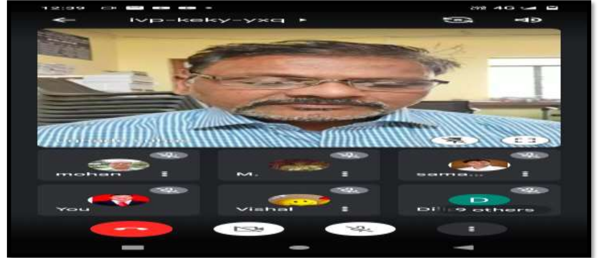
Workshop on New Syllabus