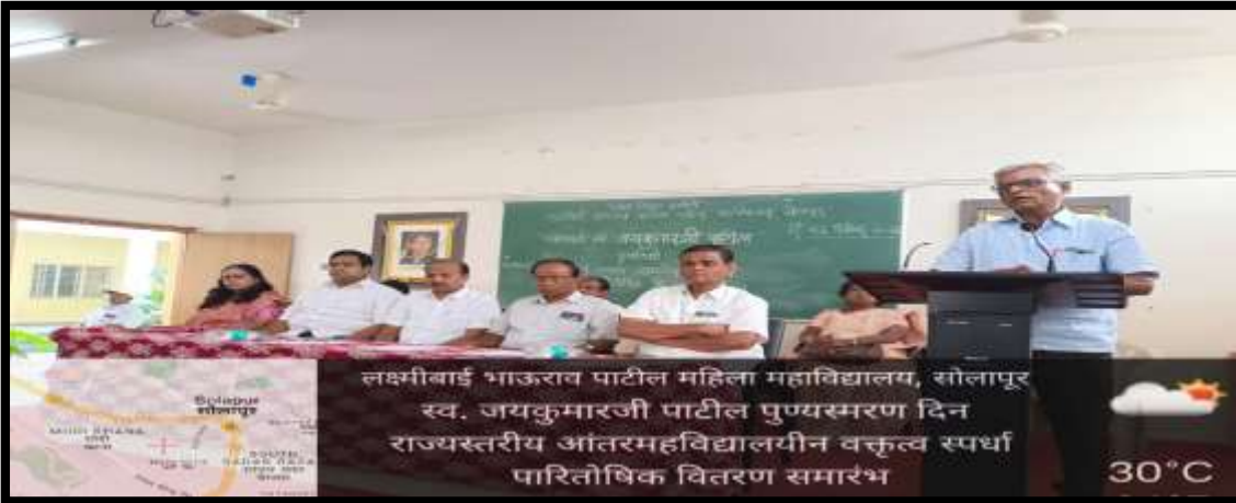
State Level Elocution Competition