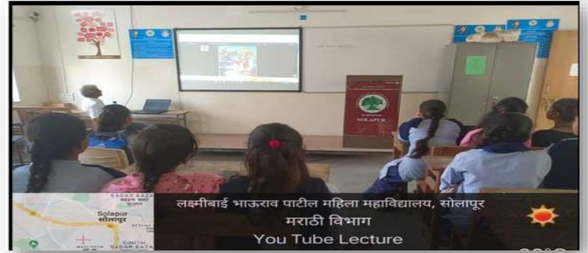
लक्ष्मीबाई भाऊराव पाटील महिला महाविद्यालय, सोलापूर मराठी विभाग You Tube Lecture