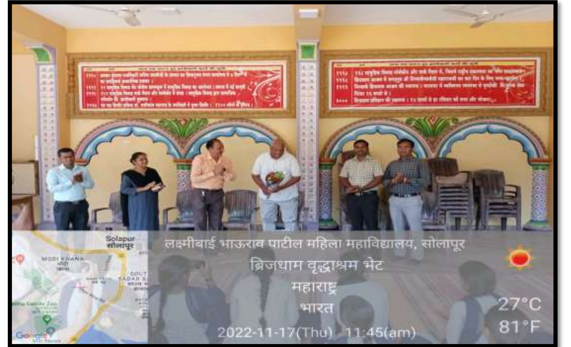
Visit to Old Age Home